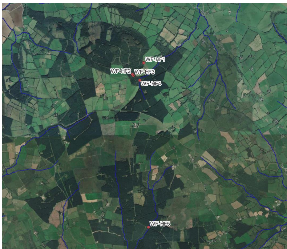
Figure 1-2 Watercourse Crossings

A list of all crossing points and their coordinates in the ITM system are provided in Table 1-1.