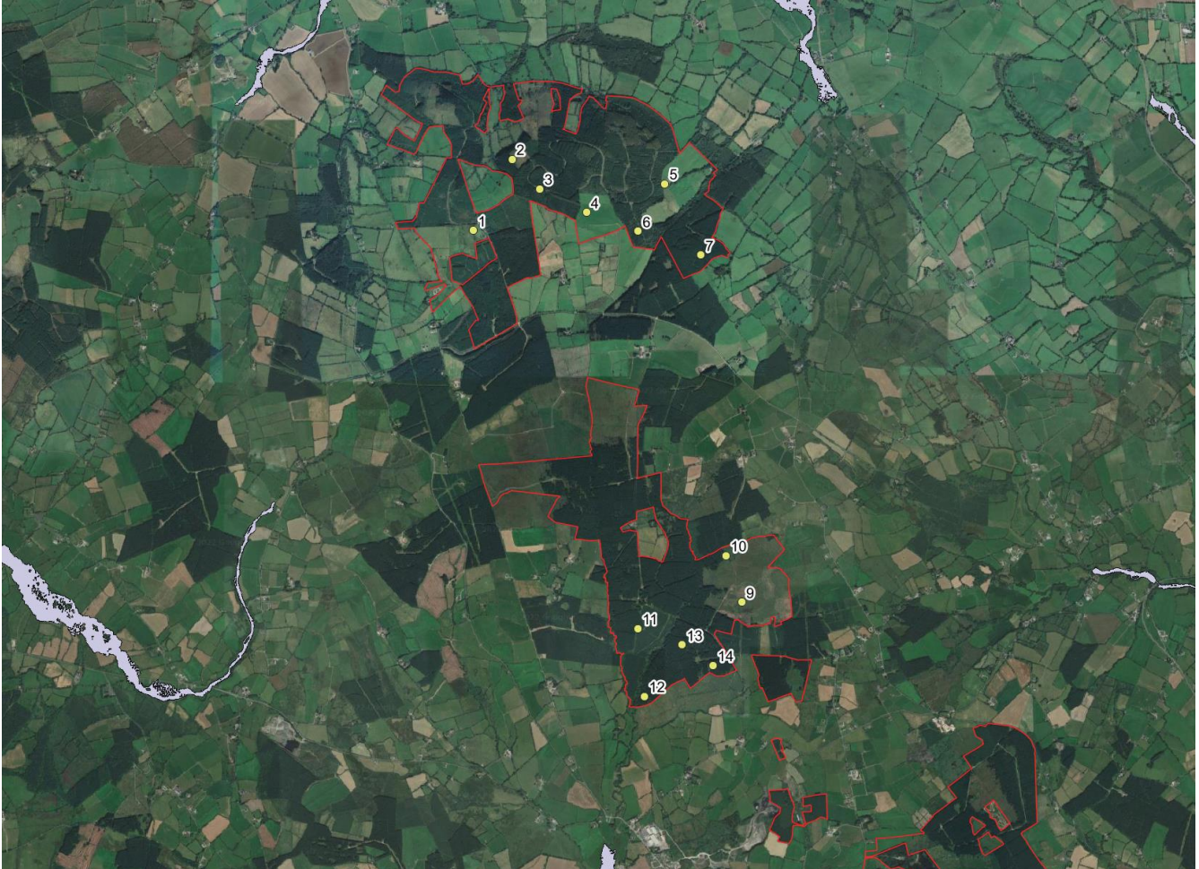
Figure 4-1 NIFM Maps – Flood Zone A and B

According to the NIFM data, the subject site is within Flood Zone C as shown on Figure 4-1 below.